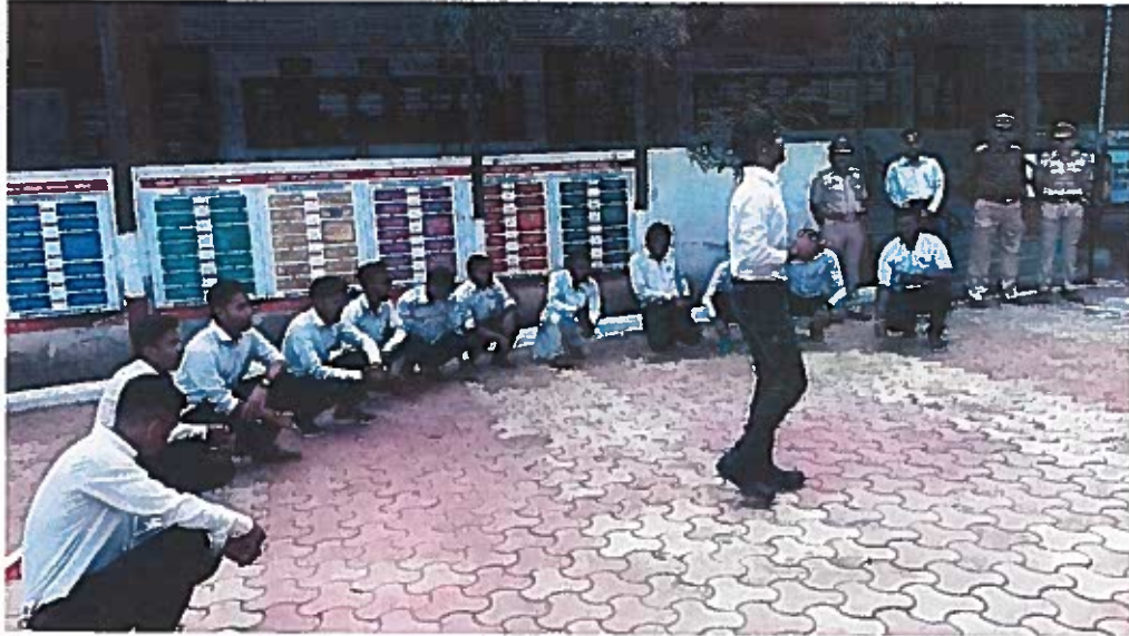
NSS Voluteers performing Street Play at RTO Office, Nashik