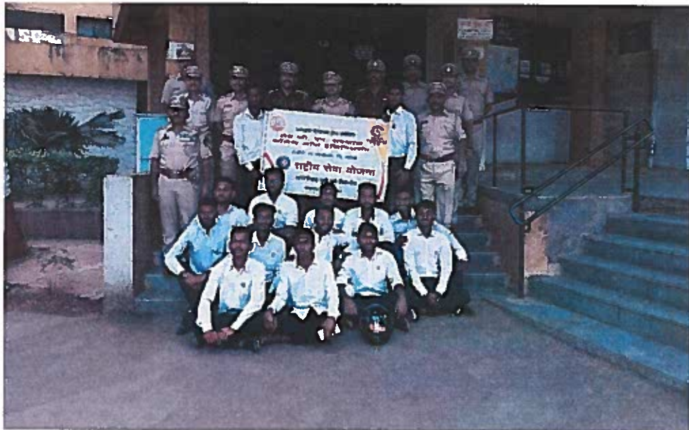
NSS Volunteers along with RTO Officials, Nashik.